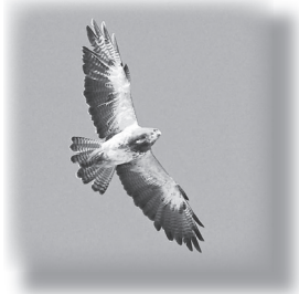
Swainson's Hawk