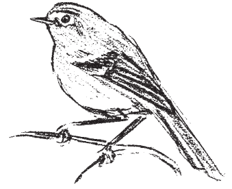
Hutton's Vireo