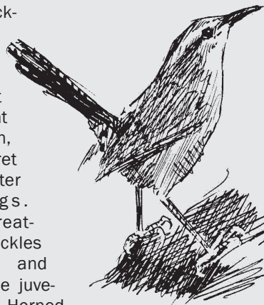
Bewick’s Wren Kirsten Munson

Yolo Basin Wildlife Area (3/26) — Rained out.