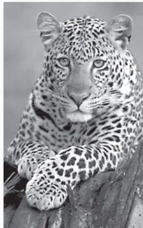
Leopard, Nakuru National Park, Kenya