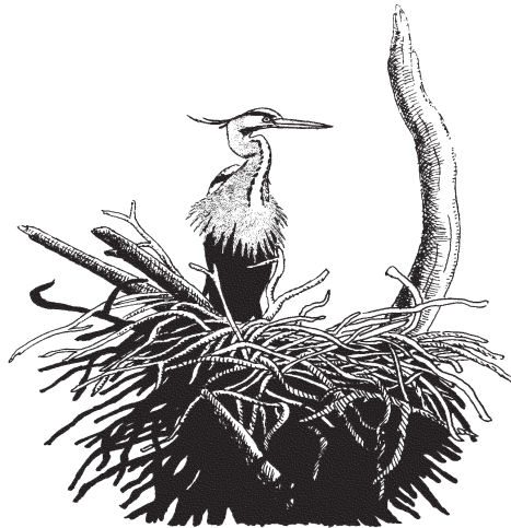
Great Blue Heron Rookery