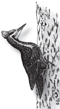
Pileated Woodpecker Steven D'Amato

The month of May can be a peak time for viewing breeding birds in Sierra Valley. This gem of the Sierras is unique in that it has characteristics of the Eastern Sierra and the Great Basin, yet is part of the western drainage. The Feather River flows out of the northwestern corner of Sierra Valley, through the Sierras and into the central valley, where it joins the Sacramento River. We will stop on the way at Kyburz Flat to look for nesting Mountain Bluebirds and other montane species, and Sandhill Cranes are possible here as well. Birding will be done mostly by car, with numerous stops along the way. Bring lunch and water, and dress for changeable weather. Meet Scott at 6am at the Horseshoe Bar Road Park and Ride in Loomis, Exit 110 off I-80.