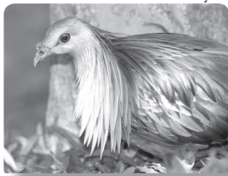
Nicobar Pigeon